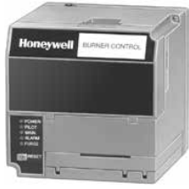
Dimensions in inches (millimeters)