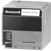
Dimensions in inches (millimeters)