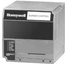
Dimensions in inches (millimeters)