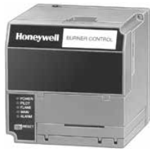
Dimensions in inches (millimeters)